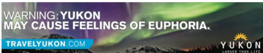
Online banner ad used in Australia consumer campaign