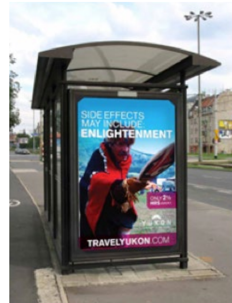
Outdoor ad located in a neighbourhood with high potential for Cultural Explorers

“The power of EQ in the Canadian markets was unleashed through the overlay of PRIZM.”